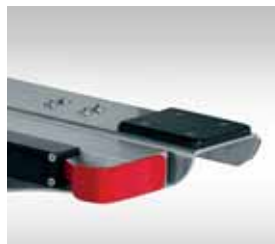
Automatic NATO Stretcher locking (STANAG 2040) through automated frame locking mechanism.

Frestems is a specialist manufacturer of military stretcher fastening systems and soldier evacuation equipment. Through a long history of equipping military ambulance vehicles and a focus on long term product development and quality improvement, Frestems has become recognized as the leading military ambulance contractor in Europe. Frestems ProMIL products are saving lives in the toughest and most demanding operations throughout the world.