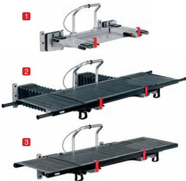
Stretcher loading 1-2-3